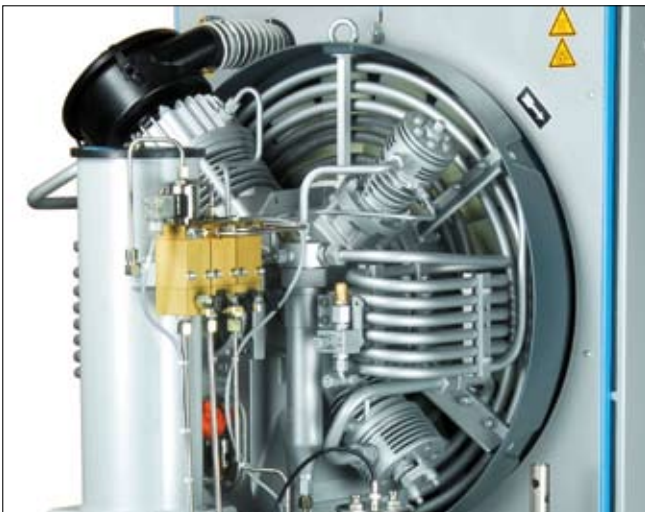
4-stage high pressure compressor block K150